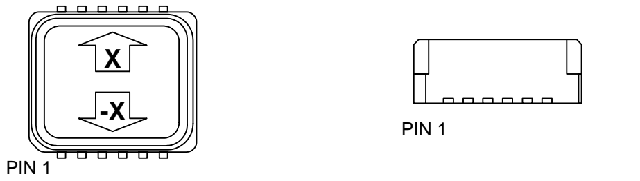
Figure 2. Accelerometer measuring directions